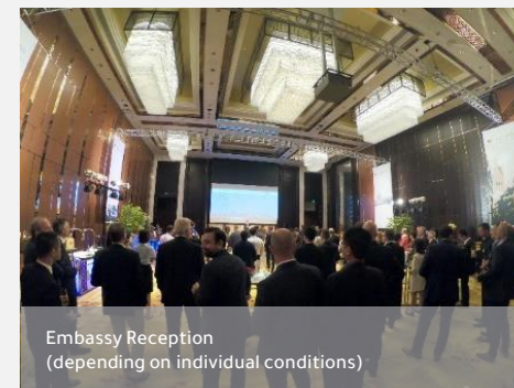
Embassy Reception (depending on individual conditions)