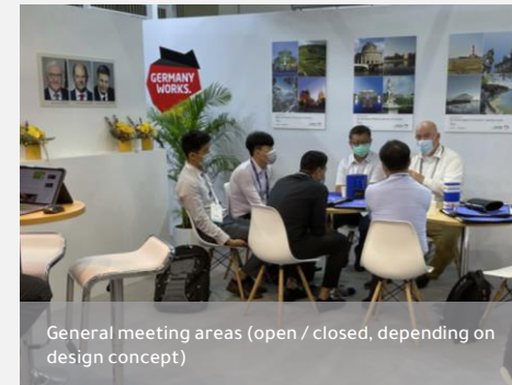
General meeting areas (open / closed, depending on design concept)