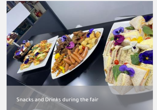
Snacks and Drinks during the fair