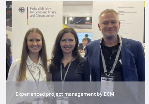
Experienced project management by ECM