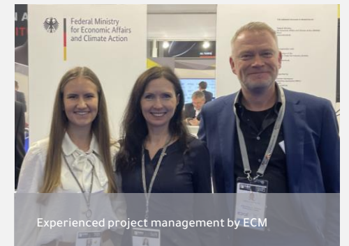
Experienced project management by ECM