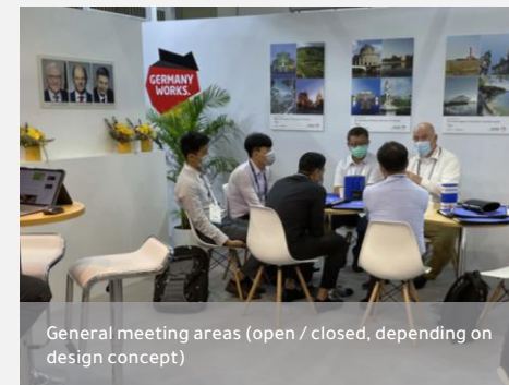
General meeting areas (open / closed, depending on design concept)